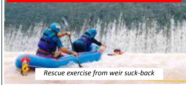
Rescue exercise from weir suck-back