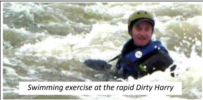
Swimming exercise at the rapid Dirty Harry