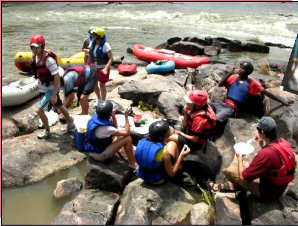
Above: A group pauses during training to grab a bite of lunch. Right: illustration of a typical river rescue exercise covered in the course Manual and practised on the river. This shows several ways of saving someone from a strainer or tree lying in the river.

The river proficiency course has developed over two decades, with inputs from American and UK trainers as well as local skills. The course Manual forms part of the training and has been newly revised to include the latest advice on equipment, techniques and standards.