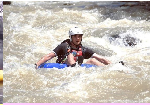
Tubing mild to wild