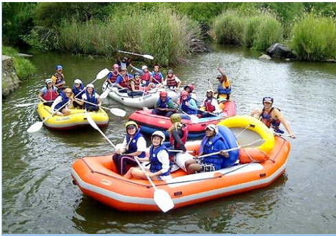
Vaal whitewater rafting